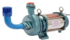
Open well submersible pump