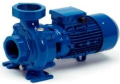
Mono block pump