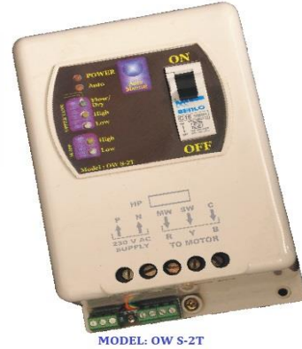
MODEL: OW S-2T